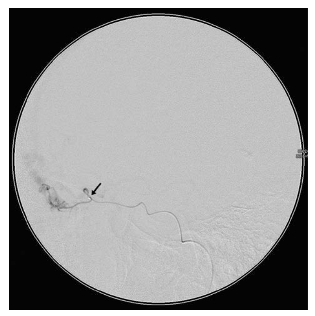
Fig. 4 Super-selective angiogram via the right ophthalmic artery shows a tortuous feeding artery and a dilated draining vein. Catheterization to the origin of the anterior ethmoidal artery induced an oculocardiac reflex (arrow).

supplied by the inferior muscular artery was affected by the 2% lidocaine. The oculomotor nerve palsy resolved within thirty minutes, however further attempts at transarterial obliteration of the fistula were abandoned. Direct surgical obliteration was performed three months later.