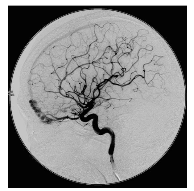
Fig. 2 Left carotid angiogram, lateral view, indicates a DAVF at the anterior cranial fossa fed by the anterior ethmoidal artery and drained by the dilated frontal cortical vein. The origin of the left ophthalmic artery is markedly kinked (arrow).

pulse rate began to increase gradually for about 20 seconds. This phenomenon repeated itself during 3 such attempts. Atropine sulfate was administered and again the microcatheter attempted to be advanced more distally, however the same reflex occurred. The microcatheter was pulled back slightly, so as not to elicit the oculocardiac reflex and the microcatheter was positioned as distally as possible to avoid retinal complication. A super-selective angiogram at the catheter position indicated an inferior muscular artery and the terminal segment of the third portion of the right ophthalmic artery (Fig. 5). A provocation test was attempted using 2% lidocaine, however the patient complained of diplopia and an abducting eye movement was observed. Anisocoria and blepharoptosis were not observed, therefore temporary partial oculomotor nerve palsy was diagnosed. It was also postulated that the inferior division of the oculomotor nerve