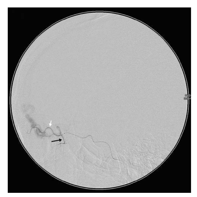
Fig. 5 Super-selective angiogram via a microcatheter placed slightly proximal to the former position (Fig. 4) did not elicit the oculocardiac reflex. The inferior muscular artery (black arrow) and the terminal third segment (white arrow) are visualized. A provocation test at this catheter position elicited temporary partial oculomotor nerve palsy.

Initially, this symptom was not recognized as an oculocardiac reflex, thus several attempts were made at what is actually a dangerous catheterization. Every procedure was performed