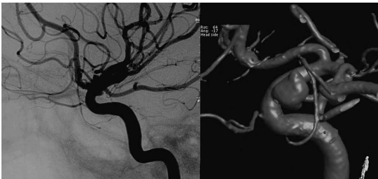
Fig. 1 Digital subtraction angiography (lateral view, left) and 3D rotation angiography (oblique view, right) showing that the ophthalmic artery comes from the intracavernous portion of the ICA and runs through the SOF. Note the atypical origin and course of the ophthalmic artery.

According to Padgett 12 , a branch of the ICA, called the primitive DOA, emerges in the sequential development of the